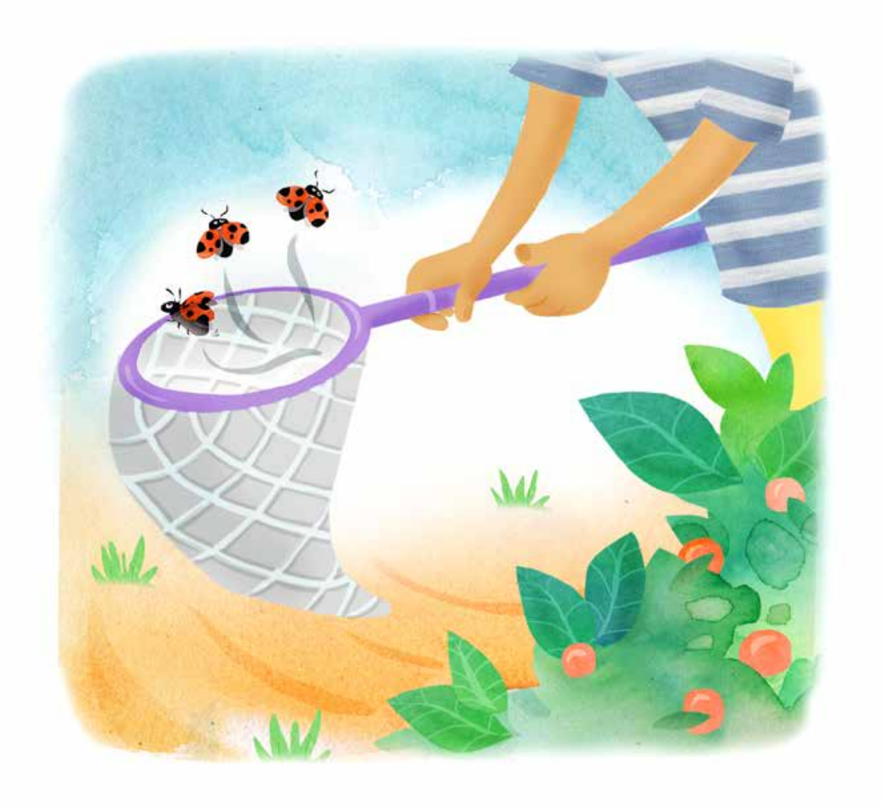
Three at the park.