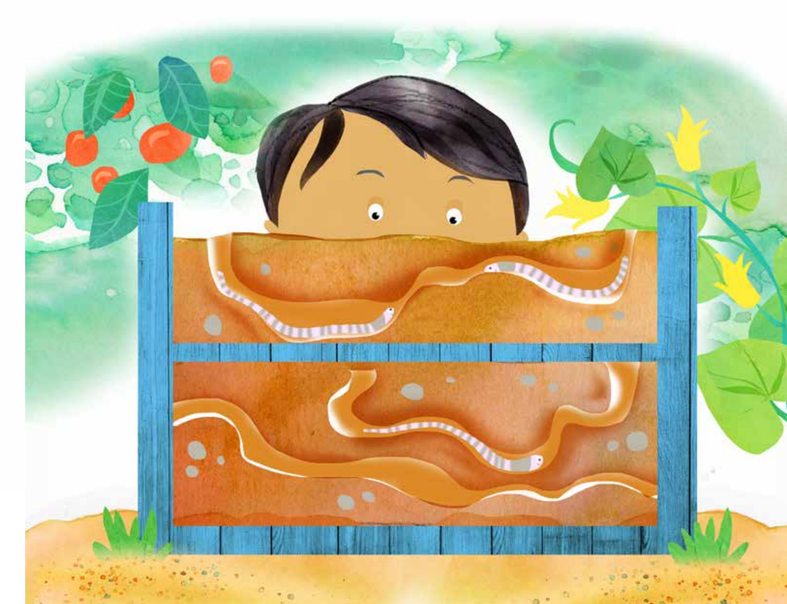
He helps with the compost, and works with his Grandpa all day.