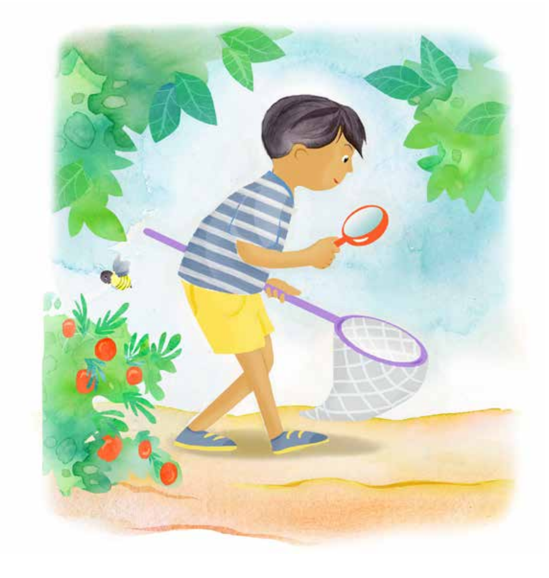
For a whole week, Amir looked and searched and collected.