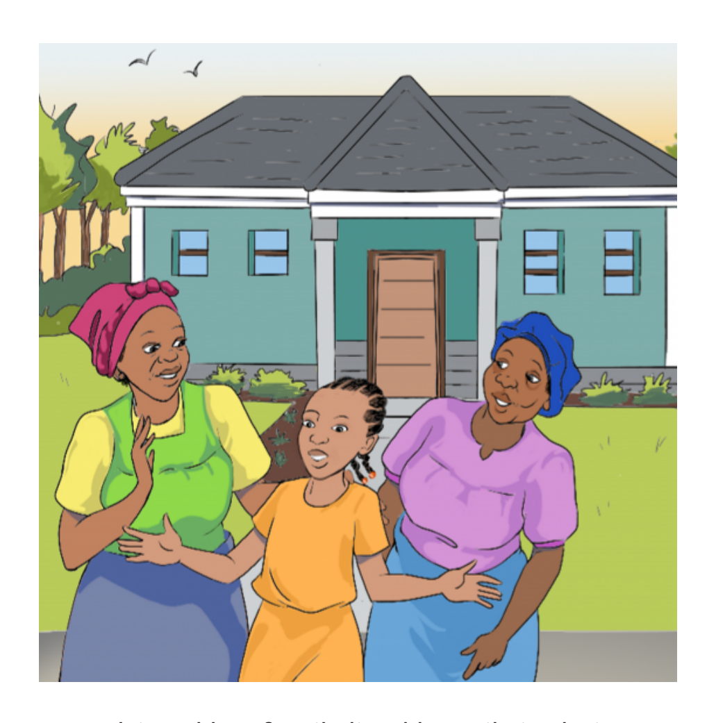
Matodzi and her family lived happily in their lovely house by the forest.