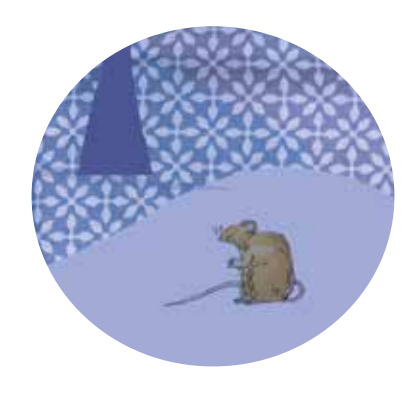
Robala hantle, Tweba.