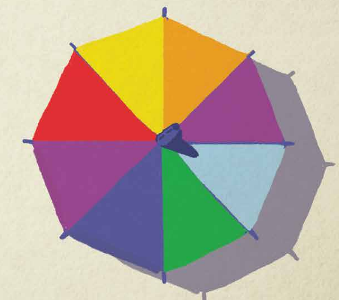
"Hmm, I see red and orange, yellow and green, blue and purple," says Tone.

"Look at that, Tone. What is it?" says Nyunyu.