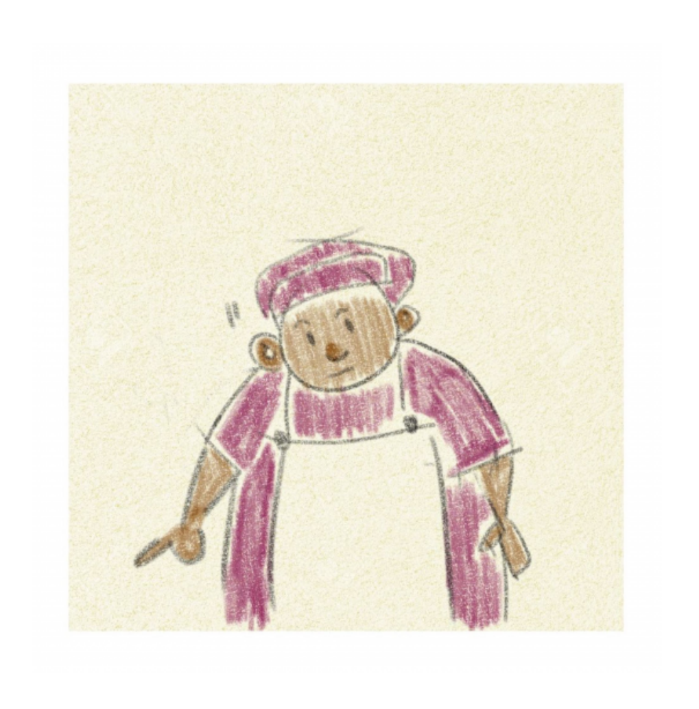
"Lesedi," says Grandma, "Truly this is no way for a young lady to behave."