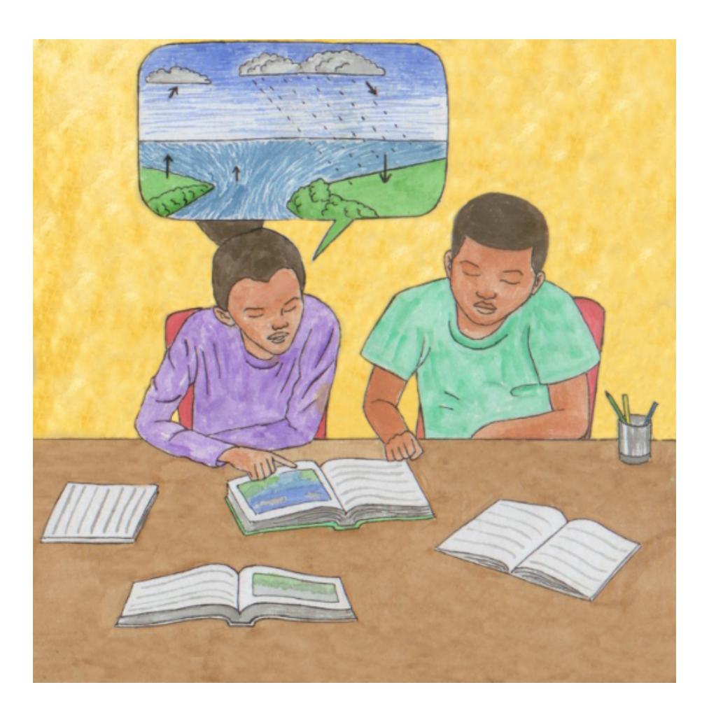
"Let's study the water cycle.

It's a process where water moves up from the earth into the air and collects in clouds," says Naka.