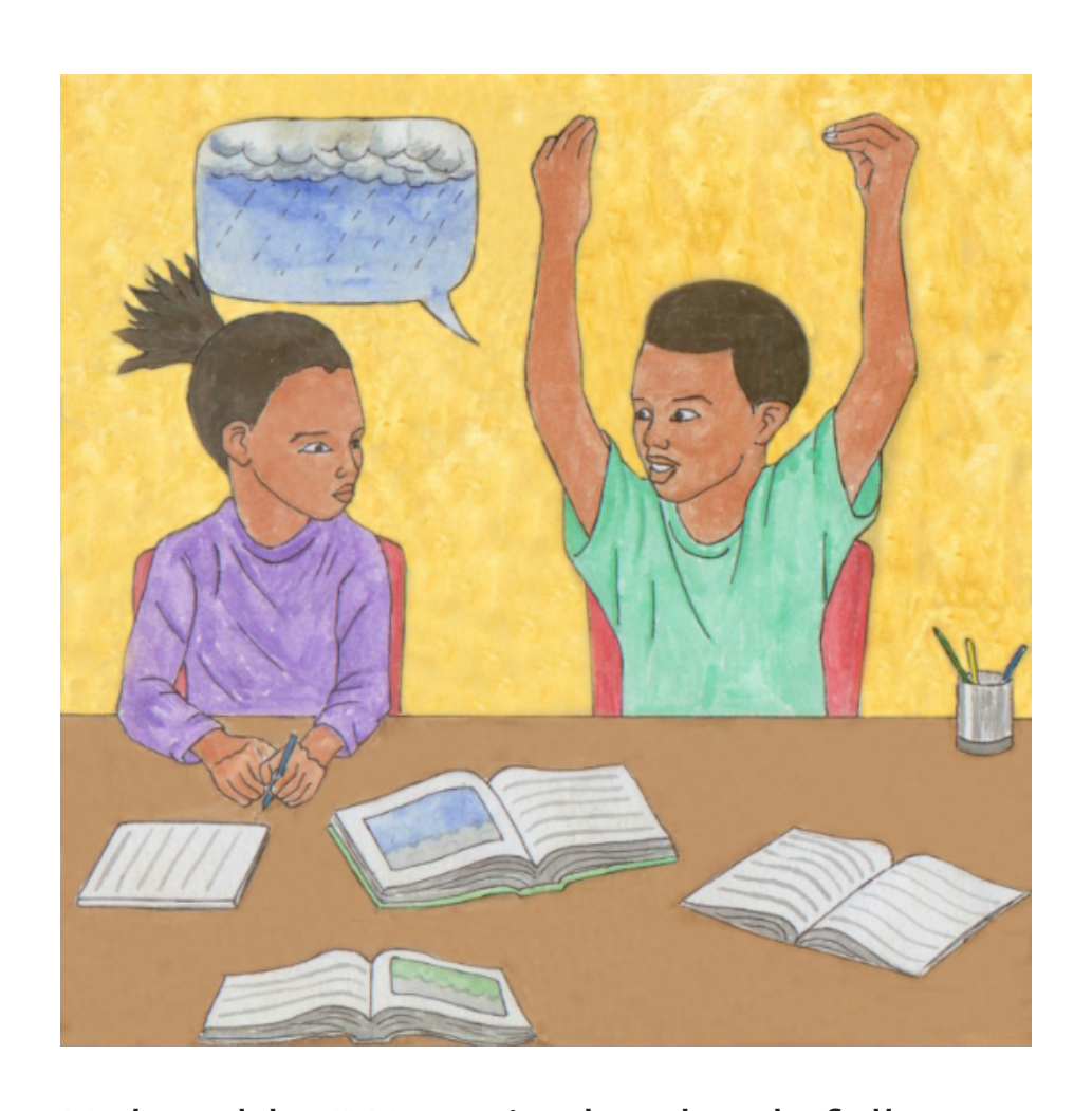
Nala adds, "Water in the clouds falls to earth as rain, hail, or snow."