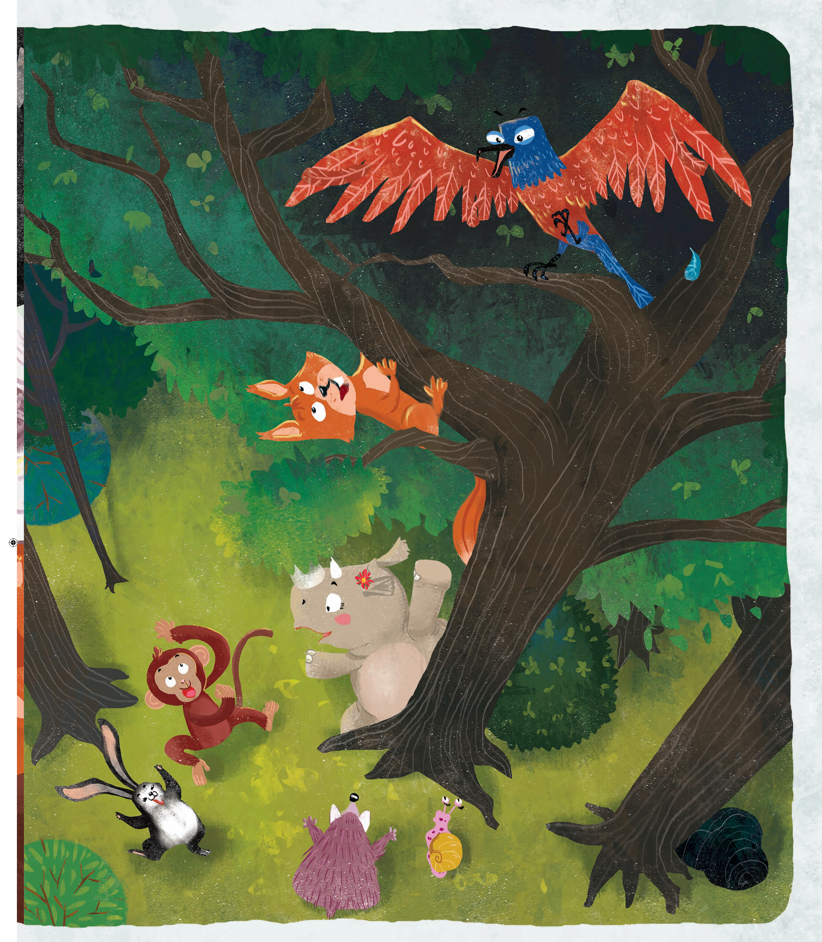
Parrot confidently hides on a tree branch. Rhino can find them all.