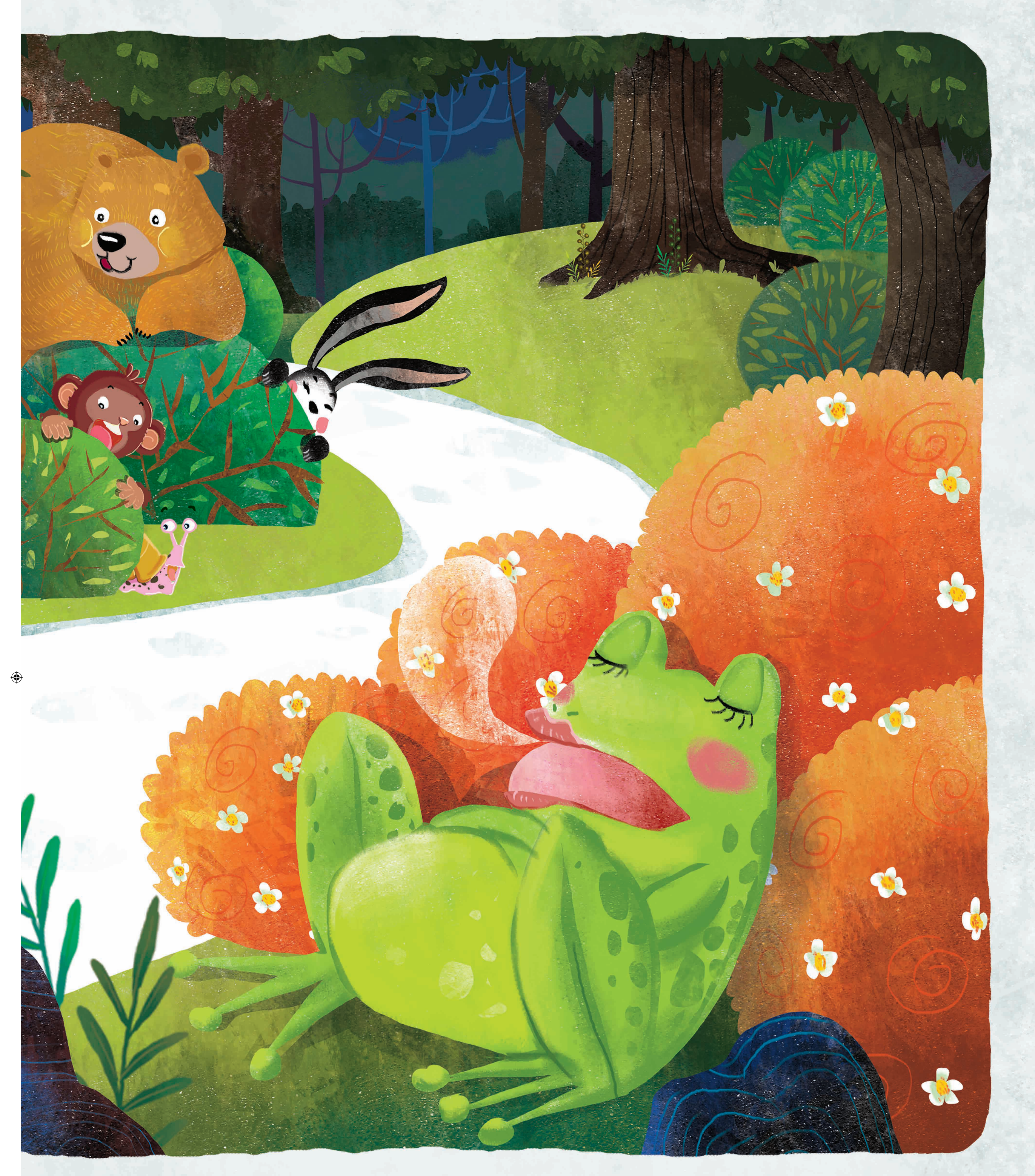
However, Rhino notices and find them all.