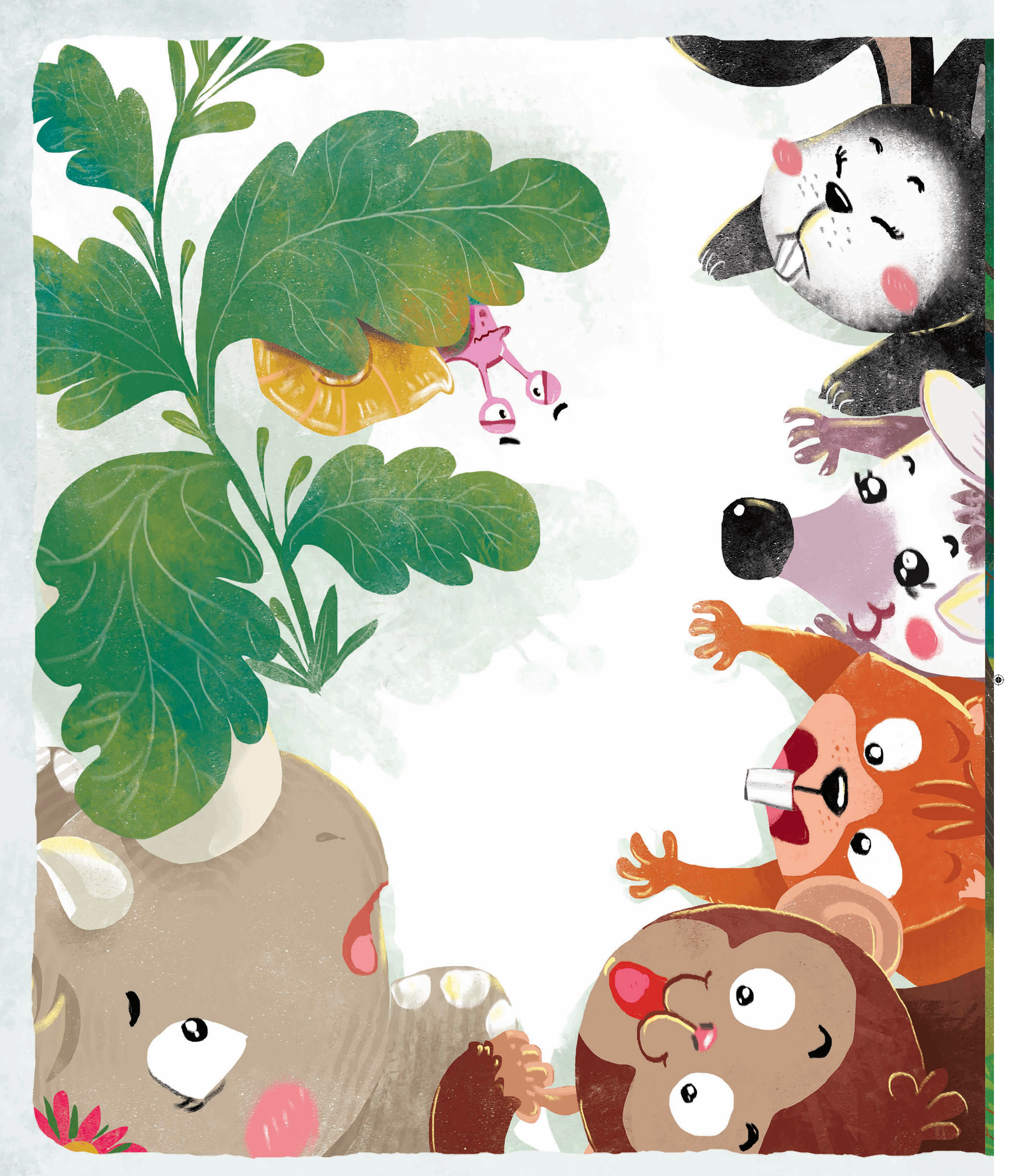
Snail slowly hides under a small leaf.