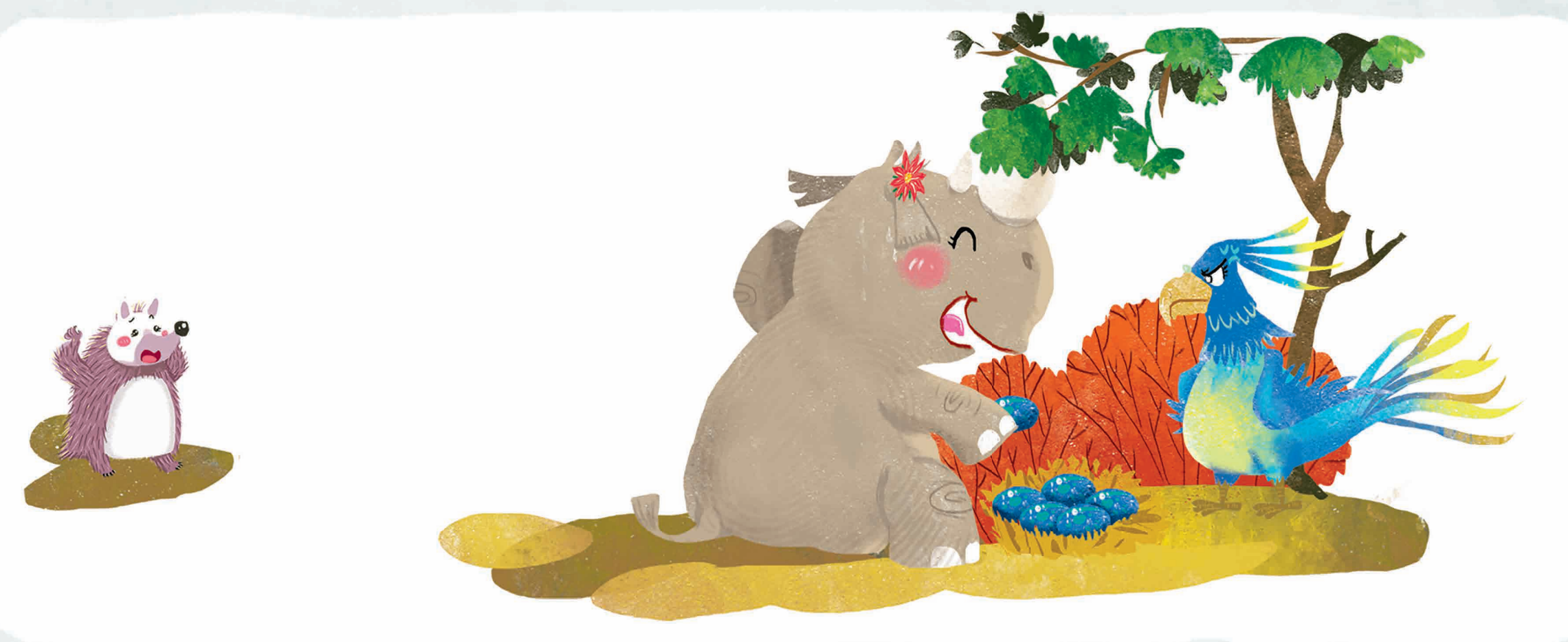
Go finding Gecko everywhere, Rhino's feet have worn out.