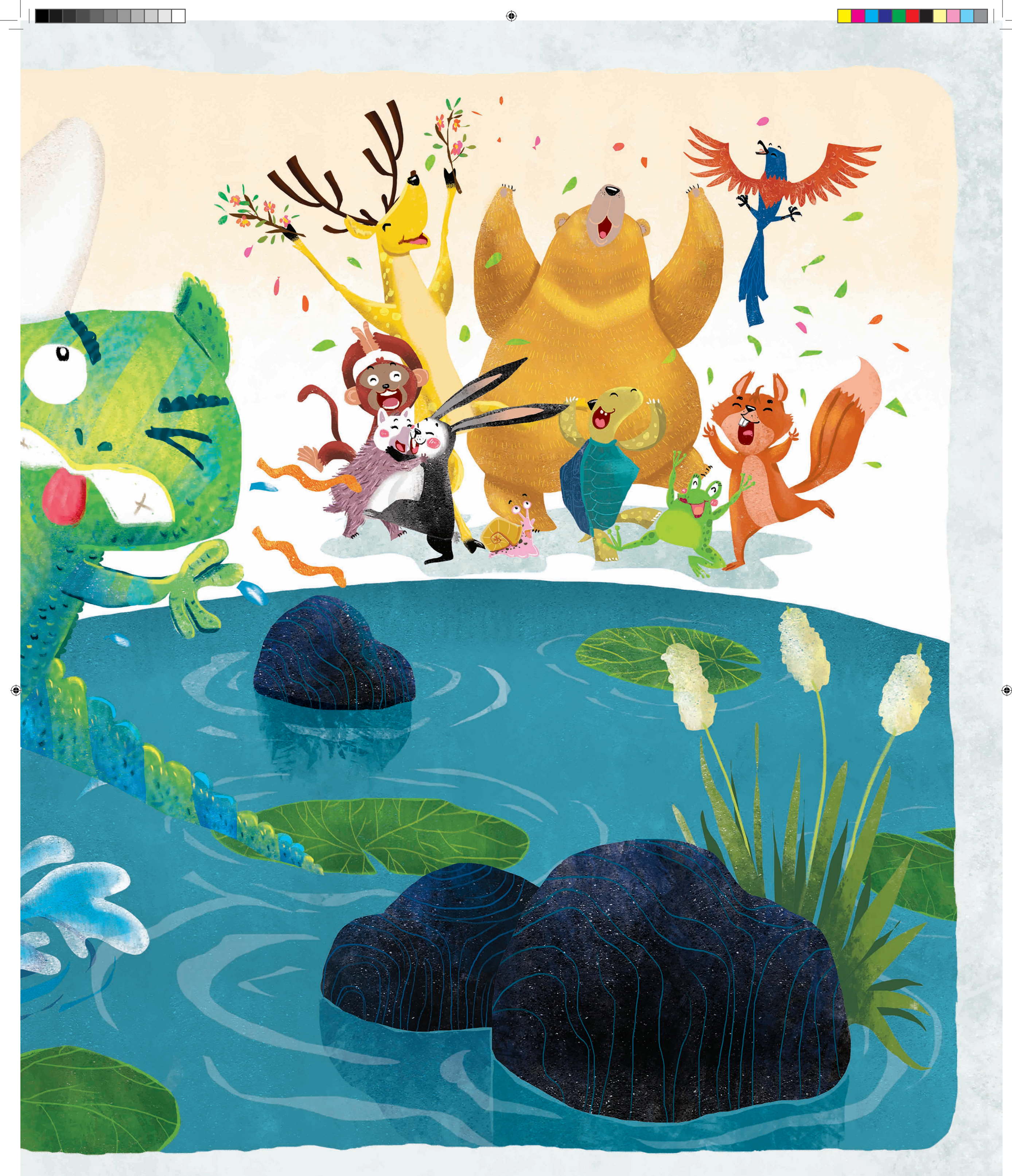
Gecko forces a smile "Yes! I hid right on your horn. That is not a bad idea."