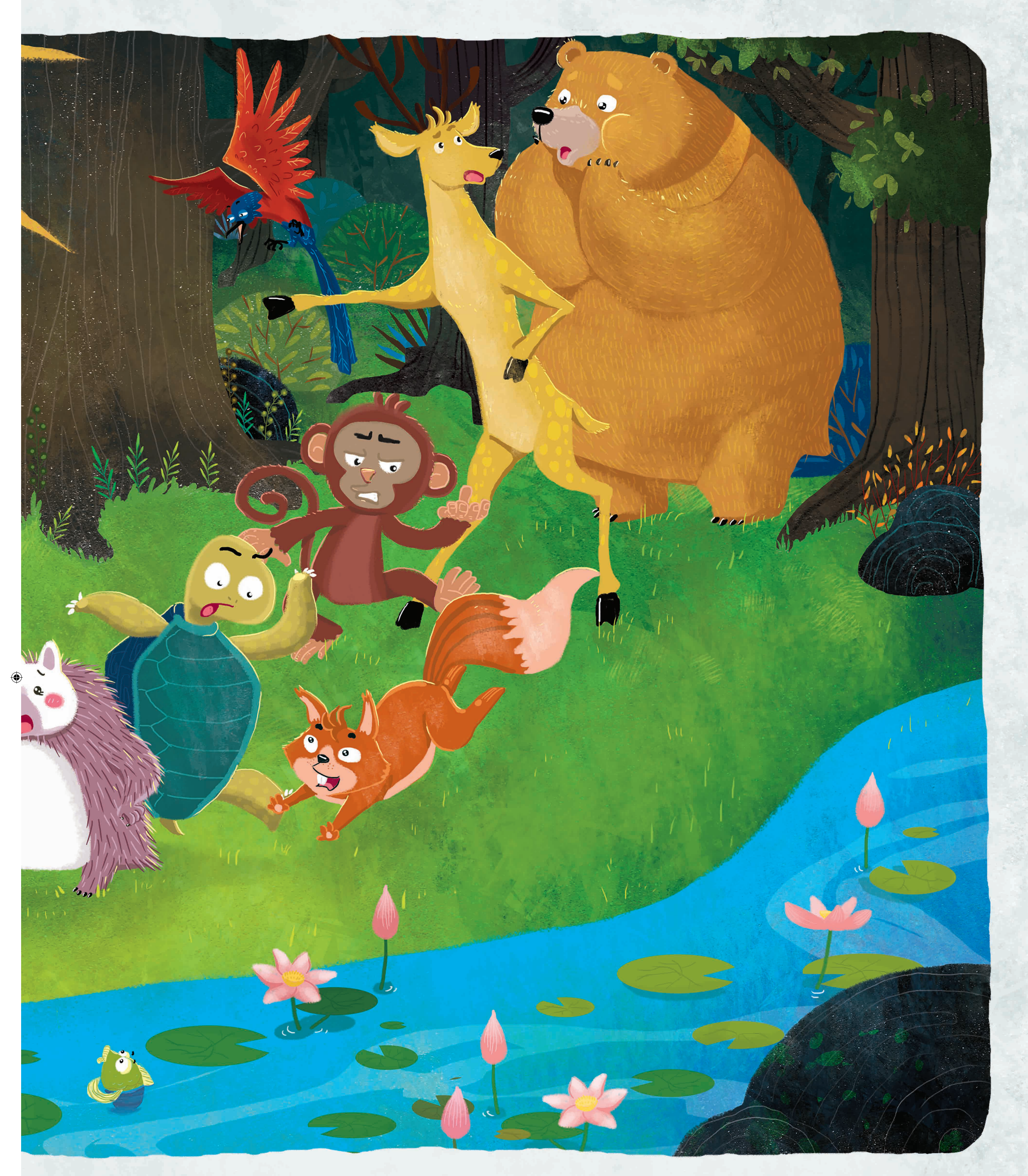
The animals all say "Rhino has to struggle this time."