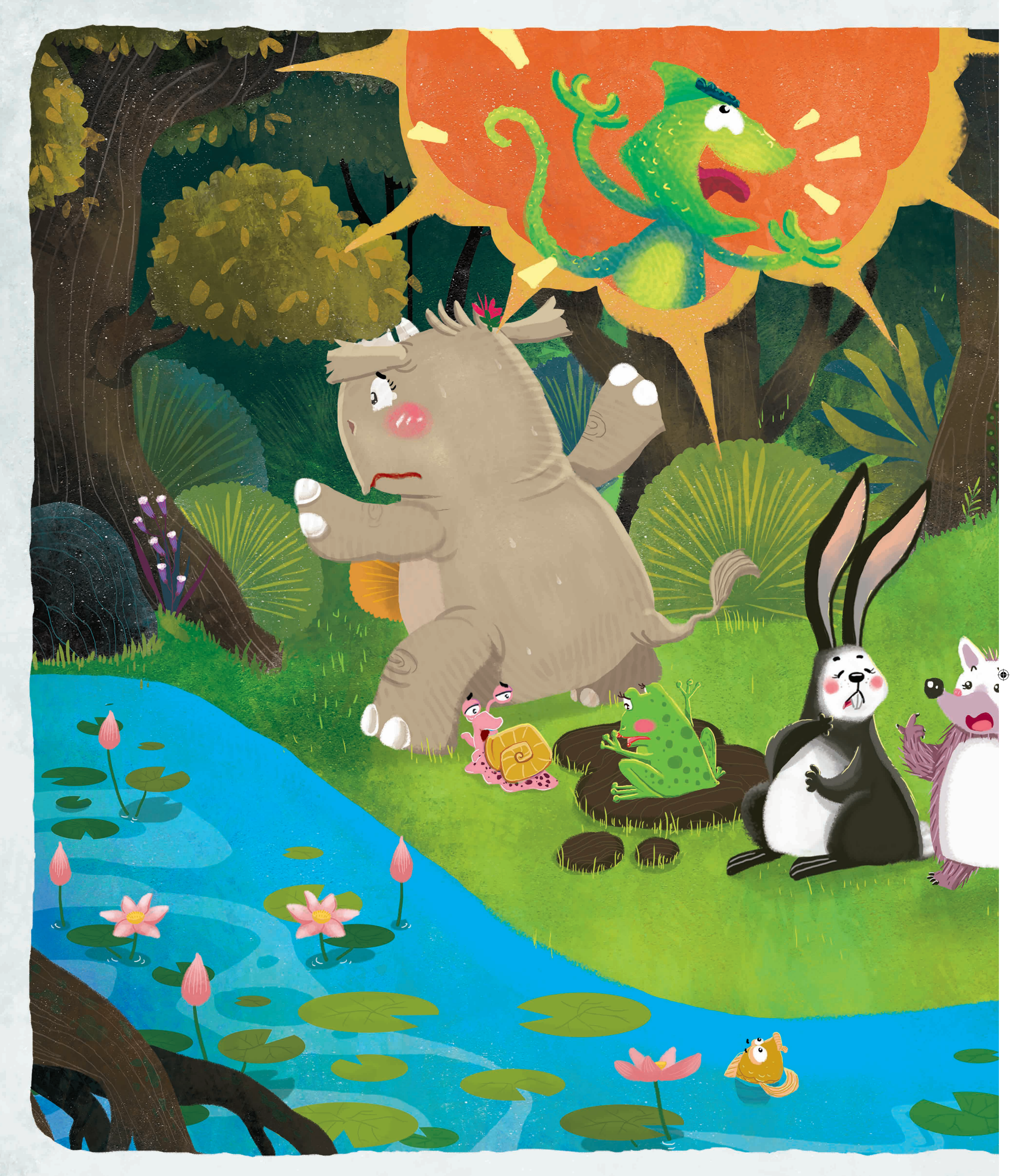
Only Gecko has still not been found. Rhino cannot find him anywhere.