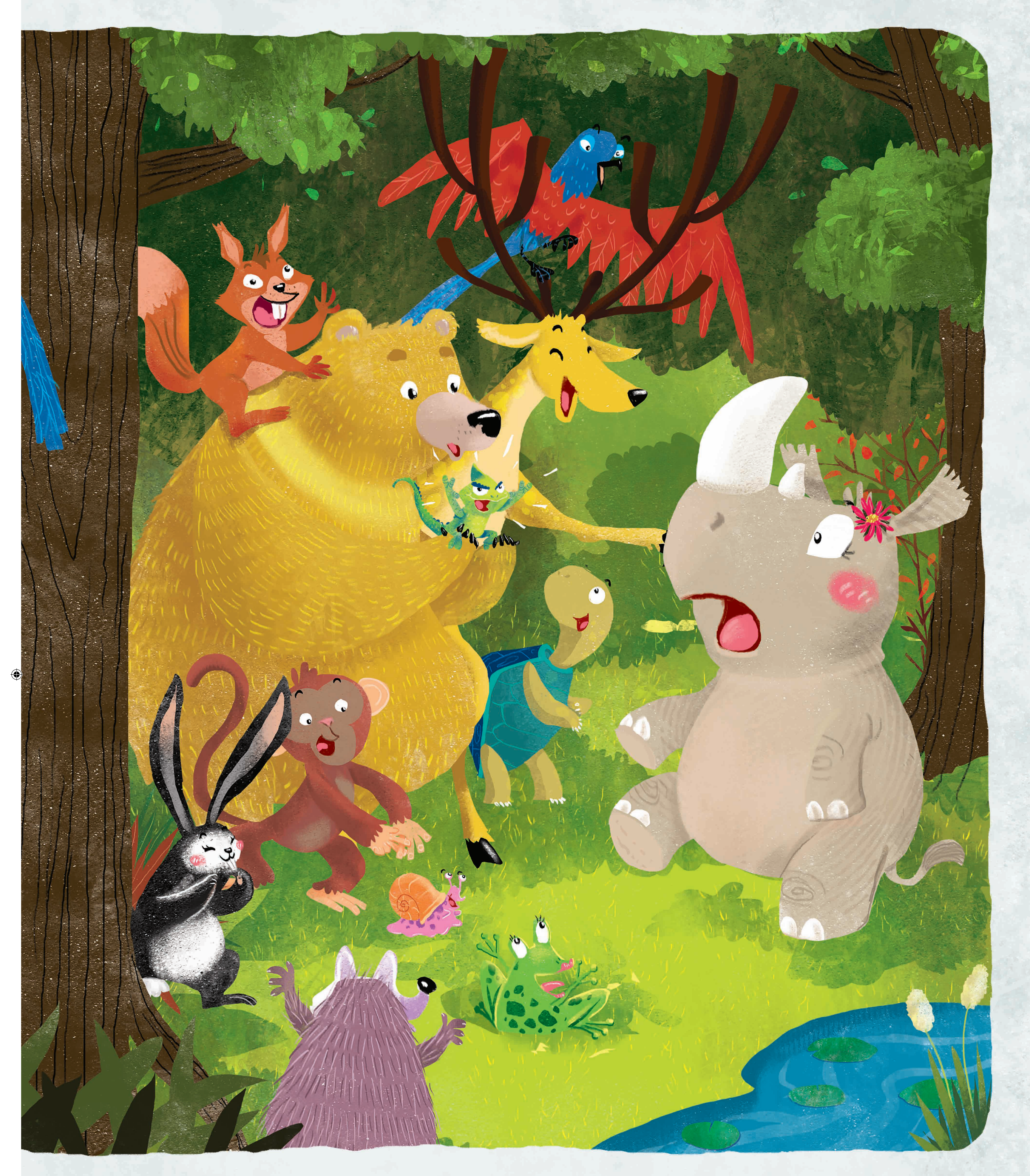
"Rhino! Do you want to play hide and seek with us. We will decide roles by rock-paper-scissors."