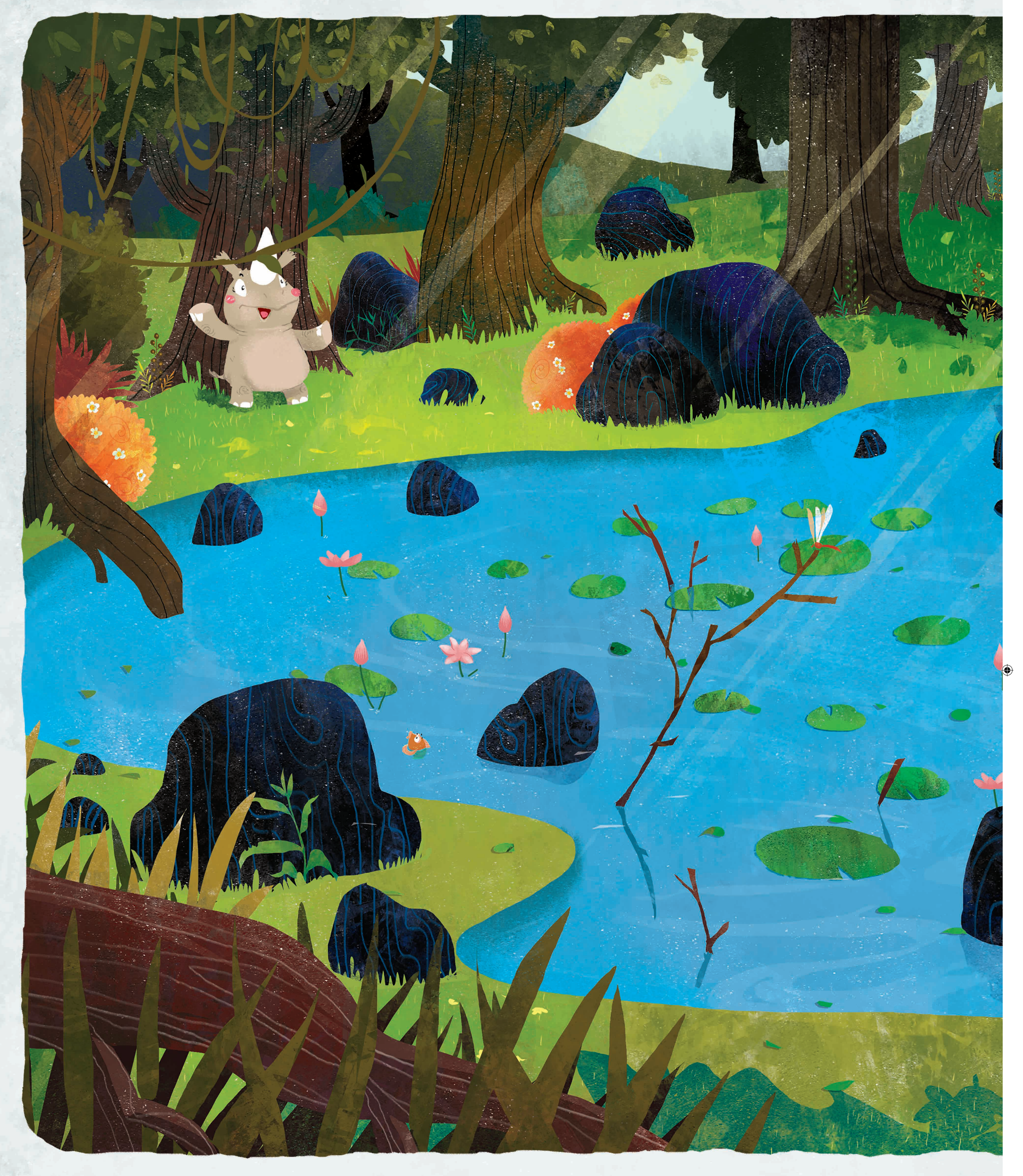
Rhino is counting "Five, Ten, Fifteen..."