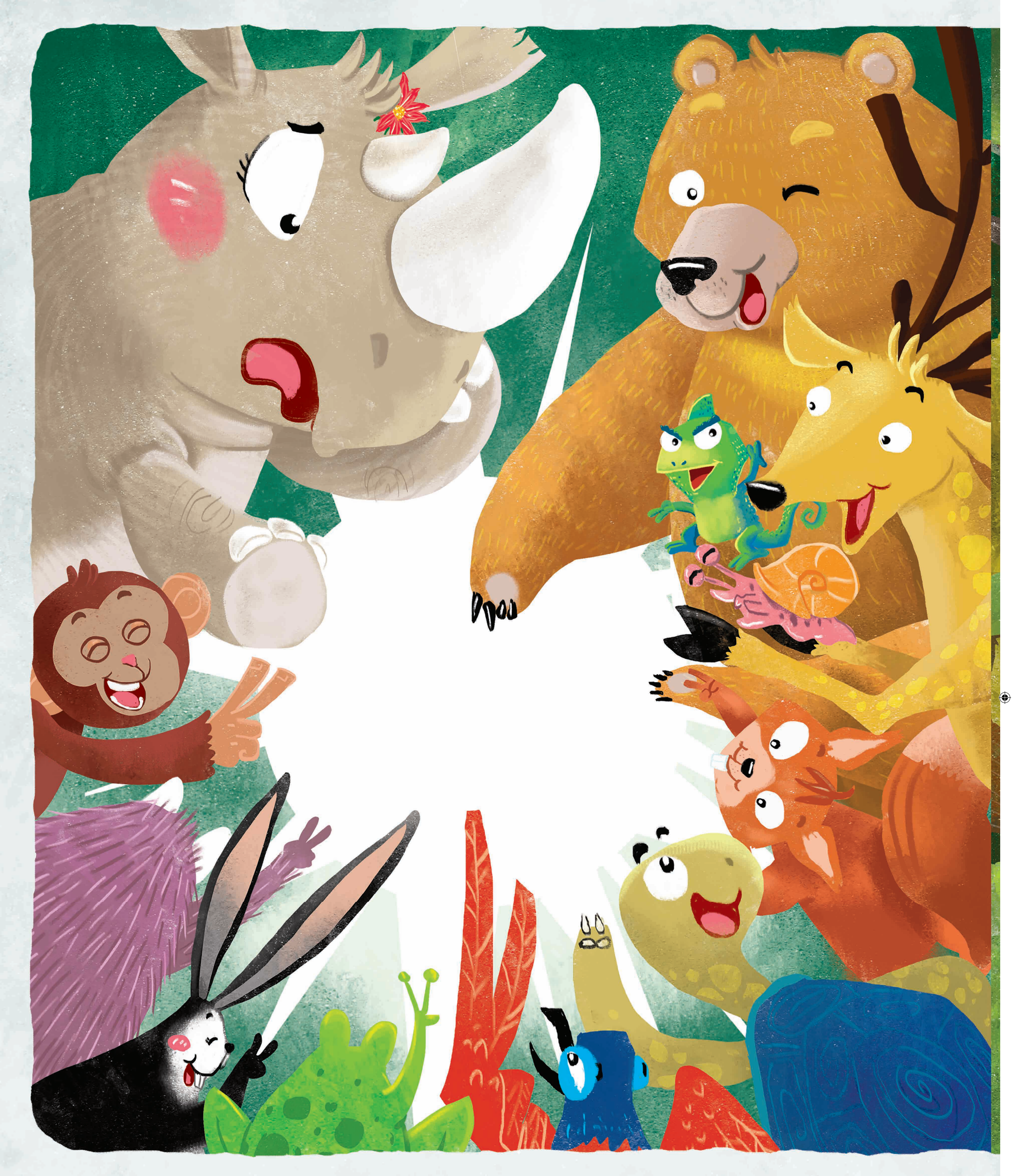
Rhino can only have paper. Knowing this, other animals have scissors on purpose.