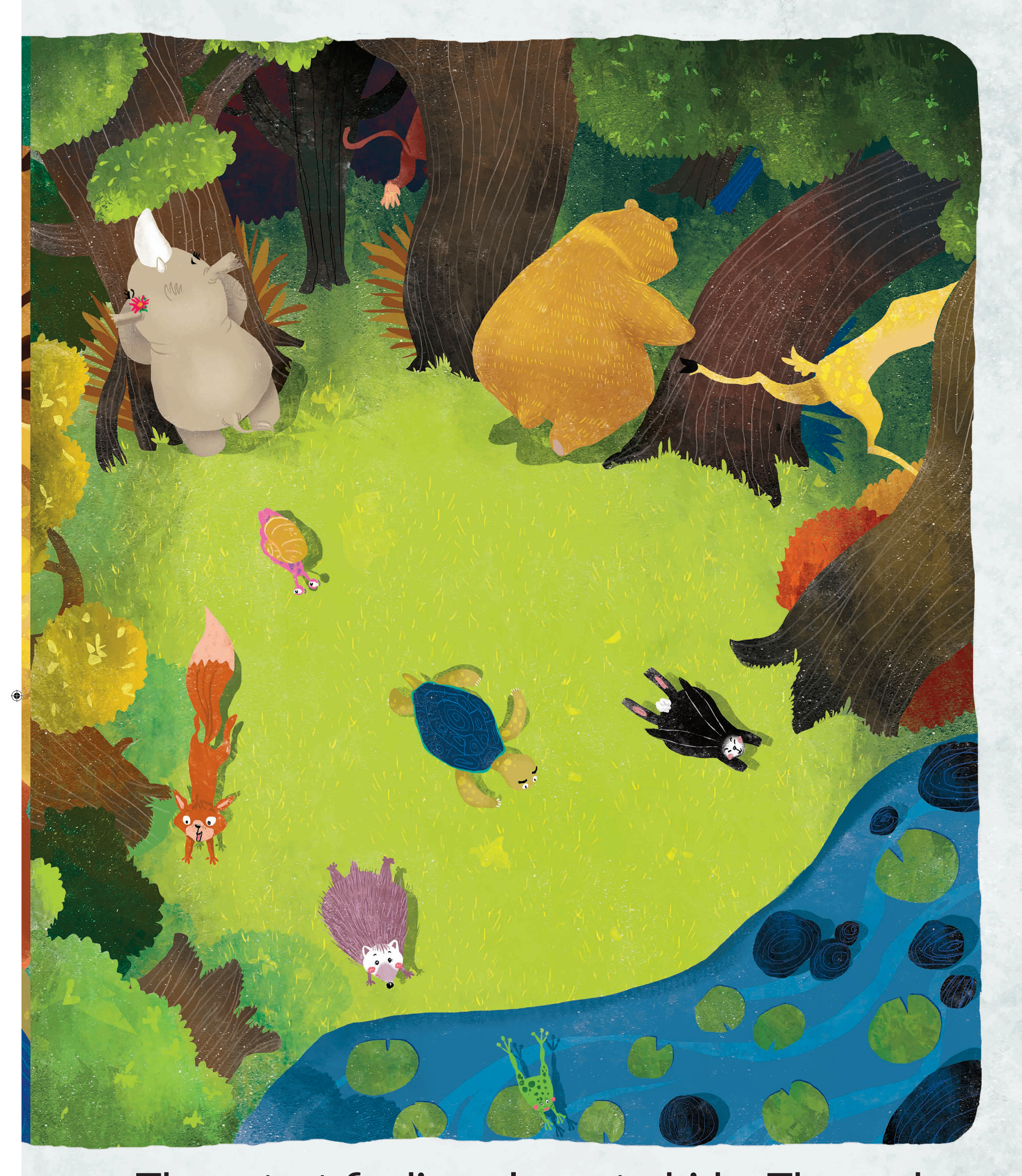
They start finding places to hide. They ask one another "Where should we hide so Rhino cannot find us?"