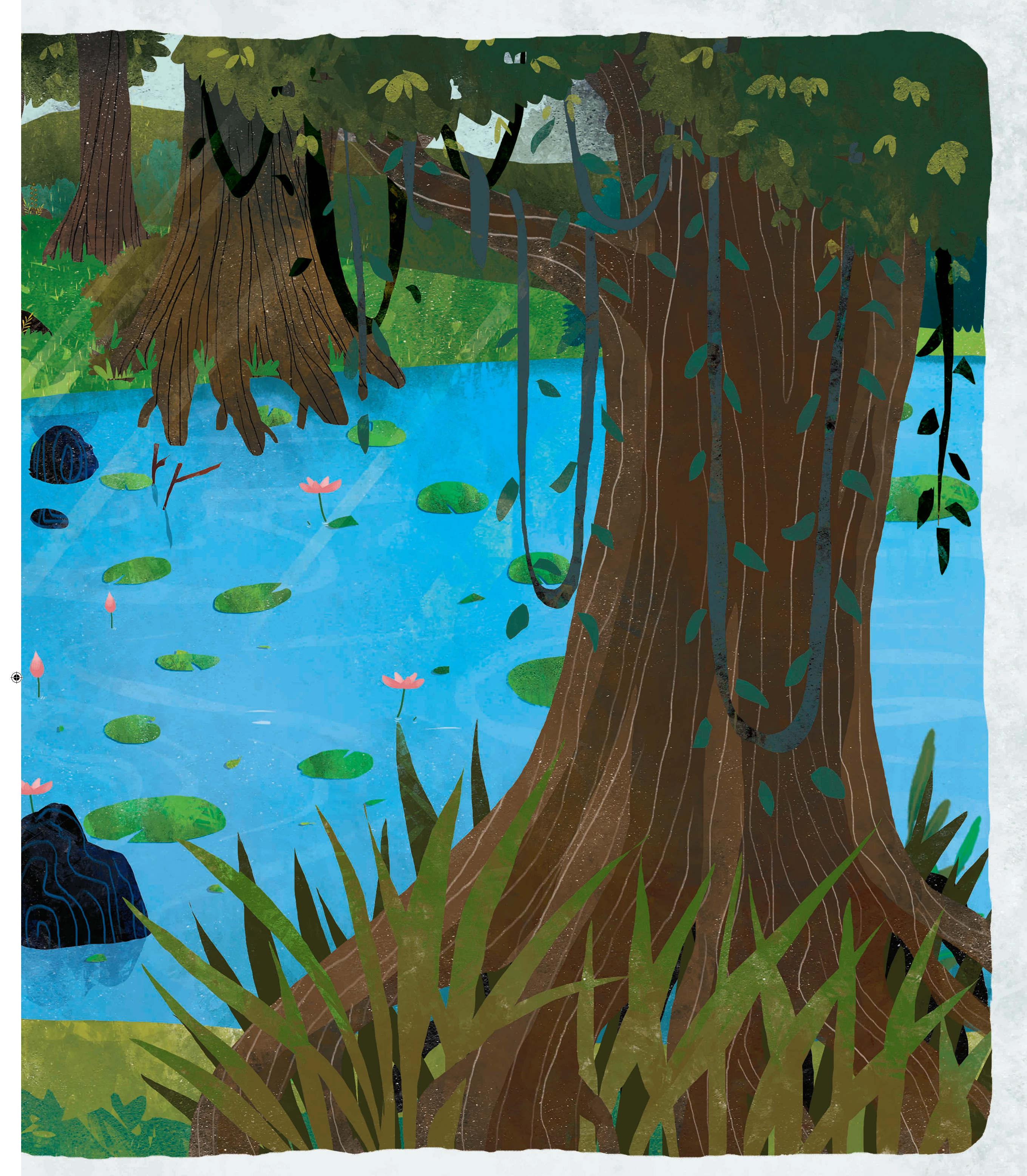
Finish counting to one hundred, Rhino opens her eyes "Where are they? How can I find them now?"