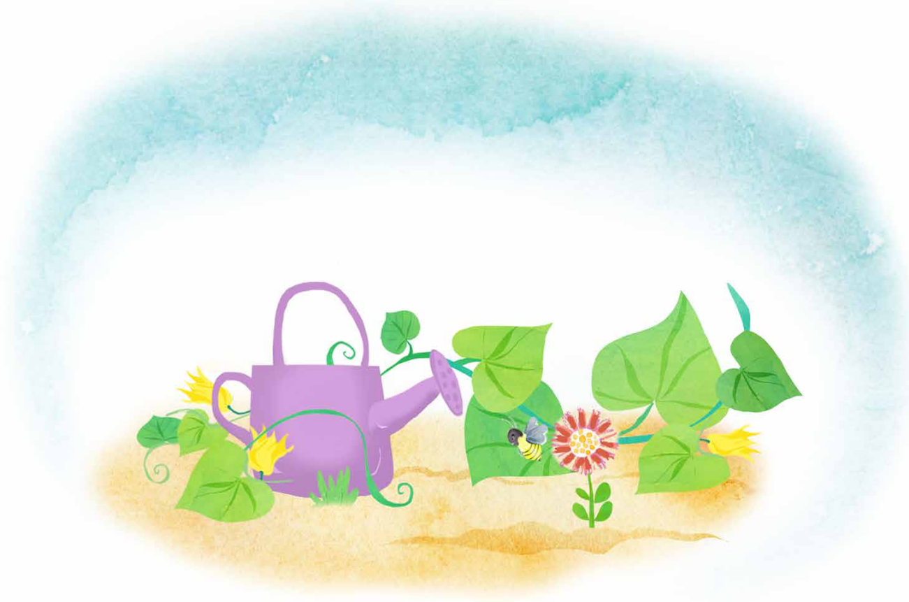
Amir help om die plante water te gee.

Hy help met die kompos, en werk dan die hele dag saam met sy oupa.